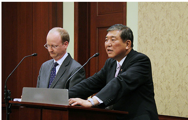
LDP Secretary General Shigeru Ishiba addresses the Capitol Hill reception

Several other promising areas for US-Japan cooperation were also proposed in the discussions. In addition to closer cooperation on disease surveillance, both sides felt that Japan and the United States can play a special role in helping strengthen food and drug regulatory systems in developing countries, especially by training food and drug safety professionals. Joint studies on dementia were also raised as one area ripe for