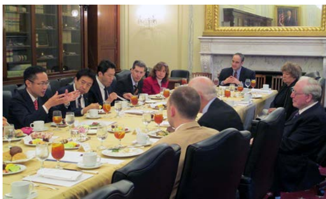
Delegates talk with Sen. Ben Cardin (D-MD) and Sen. Jay Rockefeller (D-WV)