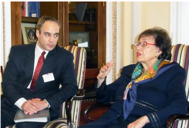
Rep Nita Lowey (D-NY) describes the Congressional debate over foreign aid