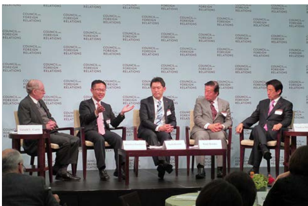
Delegation members speak at the Tadashi Yamamoto Memorial Seminar

Despite some disappointment that a bilateral deal on the conditions for TPP could not be announced during the Obama visit, the Japanese delegates felt that the two countries have reached agreement on 85 to 90 percent of the issues needed to complete the negotiations. However, ruling and opposition party members alike felt that Prime Minister Abe can no longer make any serious concessions until after the US Congress votes to grant trade promotion authority (TPA) to President Obama, allowing an up-or-down vote on the full deal. This presents a chicken-and-egg dilemma for negotiators, since the US strategy seems to be to get Japanese concessions in advance on a few key areas in order to convince Congressional members of the merits of awarding TPA to the president. While both the Diet members and their American counterparts felt there are still ways for both sides to move forward,