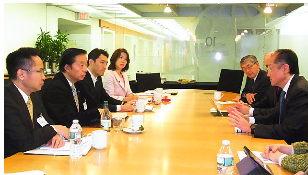
World Bank President Jim Kim and delegates discuss universal health coverage

The delegation members spent considerable time discussing how the United States and Japan can work together to better integrate programs that tackle specific diseases—like the Global Fund to Fight AIDS, Tuberculosis and Malaria—with approaches that aim to strengthen health systems across the board so that developing countries can better deal with a wide range of medical issues. The delegation explained that Japan remains a major contributor to the former, particularly through its support for the Global Fund, and Prime Minister Abe has also started to champion the latter by explicitly stating that promotion of universal health coverage (UHC) in developing countries is a priority