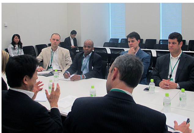
Rep. Yasuhisa Shiozaki and participants discuss trade issues

Notably, there was virtually no mention of disagreement with the substance of the decision in the delegation's meetings. Instead, the only criticism of the moves to allow collective self-defense came from those who were unhappy with the process of carrying