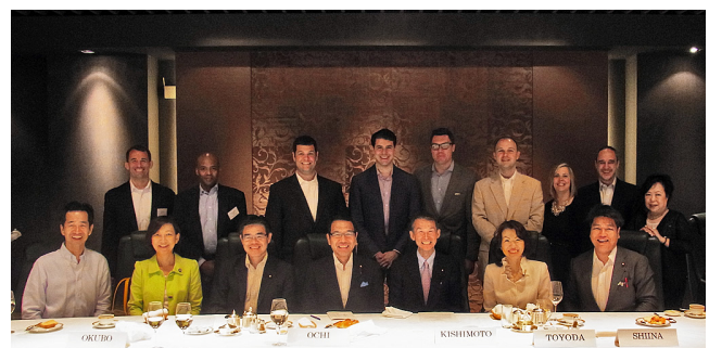
Diet members and the delegation pose after a breakfast roundtable on US-Japan relations.

Against this backdrop, the delegates had a series of discussions about the future of the US-Japan alliance. Some concerns were voiced by their Japanese counterparts about the reliability of US alliance commitments to help defend Japan in case of a conflict with China. But the government officials and military officers with whom the group spoke—including at the Yokota headquarters of US Forces Japan and at Japan’s National Defense Academy—expressed deep confidence in the alliance and praise for the close working relationship that the two militaries have developed in recent years.