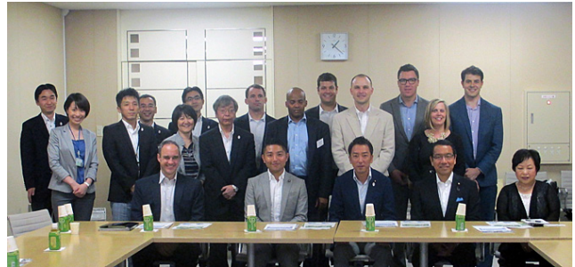
Participants with Representative Takao Ochi, Tokyo City Council members, and staff of the Tokyo Metropolitan Government

The 2014 Congressional Staff Exchange Program in Japan has been made possible with support from the Japan-US Friendship Commission and many other friends of JCIE.